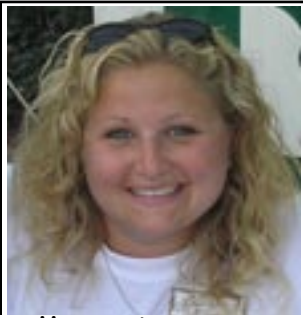
Main Village Director

Laughter is the shock absorber that eases the blows of life. ~Unknown. It was a Friday night and I had only been home from camp for about a week. I was out with a friend wearing an outfit I really liked. There I stood in the median on 79th St in NYC, waiting for the green light when my friend said, “hey we should step back from that puddle.” Not a split second after that sentence was out of his mouth, a very fast moving car drove through the gigantic puddle of recently deposited rain water mixed with street grime and doused me from head to toe. I looked like I had just gone swimming. I was soaked, dirty, and quite surprised. My friend and a few others on the street looked at me in horror waiting to see my reaction. I’m sure they anticipated anger, frustration, disgust, and maybe even tears. What came out from the depths of my soul was unstoppable laughter. Not just a chuckle mind you, but body shaking, uncontrollable, uproariously loud laughter. I’m not sure why I found it so funny as there are many other valid reactions when you are on your way out for the evening and get completely drenched with filthy water from the street, but there I was practically rolling on the ground in hysterics. I’m laughing out loud right now just thinking about it!