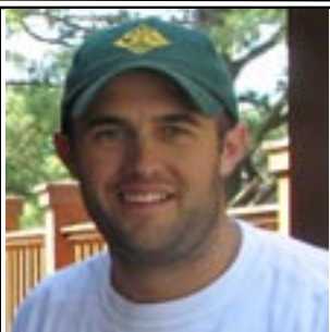
Senior Village Director