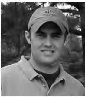
The Village Voice

As I type this article in the gray of winter it's hard to believe that camp is just around the corner. I'm not one to complain or anything, in fact we have had a pretty mild winter here in New York but it's still a bit gloomy, cold, and depressing. Everybody needs things to look forward to on the horizon. Camp is one of those things for me right now. It's hard to imagine this past summer now. Remember how hot it was? I remember everyone out on the porches at night just trying to cool off. I'm jealous of those times now!